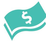
Comparison of Energy Cost and Usage of GovSense v. Customer-Hosted On-Premise Solution

Reduce upfront and ongoing costs such as hardware, maintenance, personnel and occupancy costs for a savings that can exceed $100,000 per year.